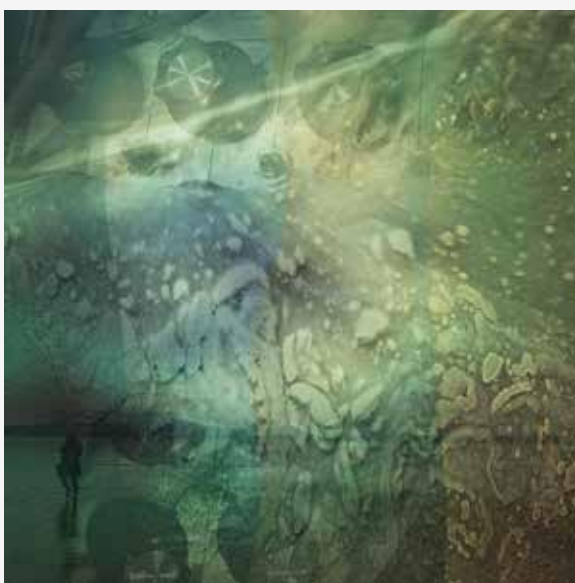
Sonic Evolutionary Arts

2016 MARKS THE TWENTIETH ANNIVERSARY OF SITE FESTIVAL OPEN STUDIOS – AN EVENT THAT NOT ONLY ALLOWS VISITORS TO PURCHASE WORK DIRECTLY FROM PARTICIPATING ARTISTS, BUT ALSO GIVES THEM THE OPPORTUNITY TO DISCOVER MORE ABOUT THE TECHNIQUES AND IDEAS UTILISED IN A VARIETY OF DISCIPLINES INCLUDING SCULPTURE, PAINTING, PERFORMANCE AND ILLUSTRATION.