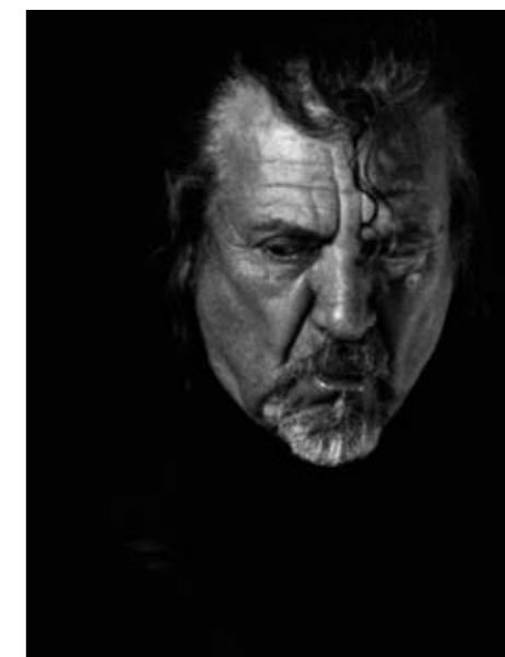
Robert Plant