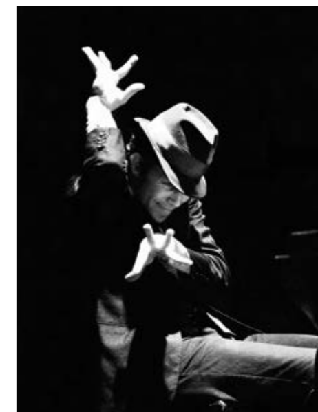
Tom Waits