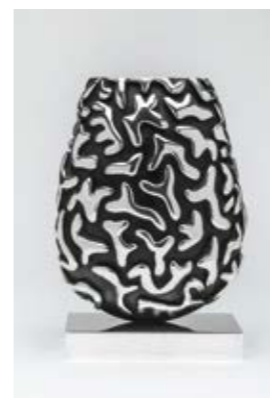
Lexicon - Jon Buck