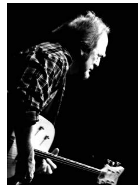
Stephen Stills

VISIT GOODONPAPER.INFO/ART TO SEE FURTHER IMAGES FROM THE KEEPING TIME EXHIBITION