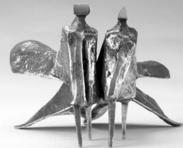
Maquette IV Walking Cloaked Figures 1978 Lynn Chadwick

GALLERY PANGOLIN CHALFORD - GLOS - GL6 8NT 01453 889765 gallery@pangolin-editions.com www.gallery-pangolin.com