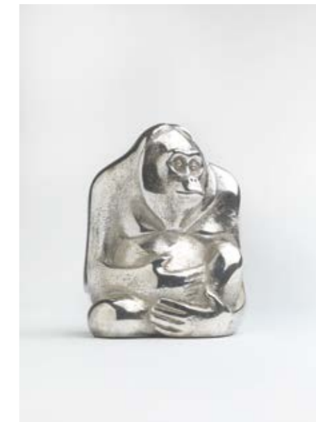
Orang Utan