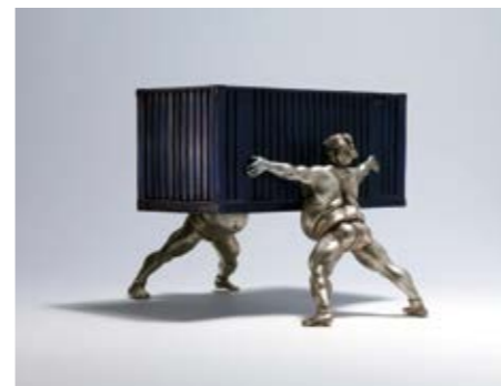
It Takes Two - David Mach