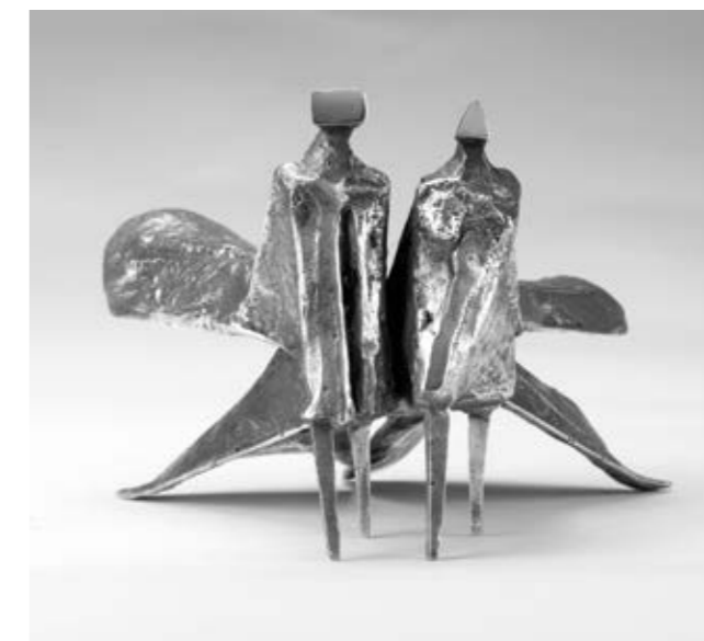
Maquette IV Walking Cloaked Figures - Lynn Chadwick