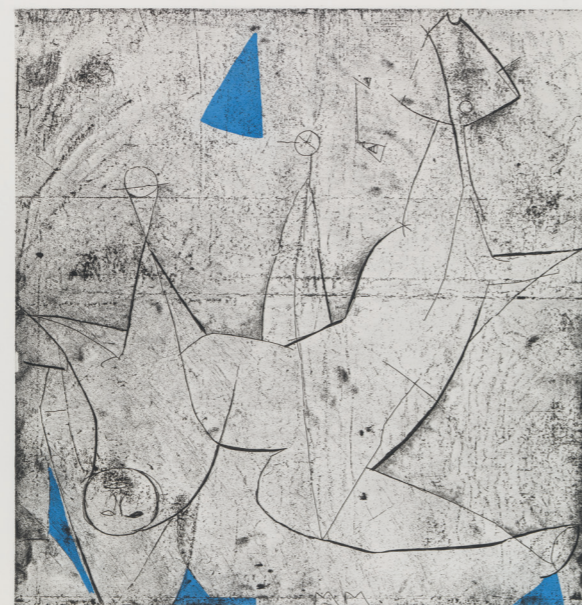
Miracolo 1970 Marino Marini