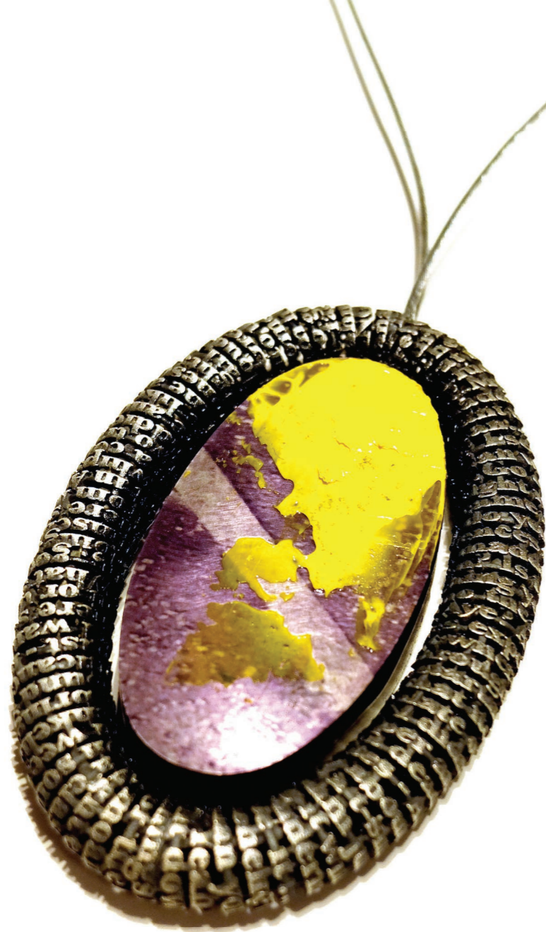
design: © chris j bailey 2017 jewellery: jonathan boyd

29 April – 28 May select festival 2017 celebrating contemporary visual art exhibitions | sculpture | jewellery showcase | workshops | talks | walks | new collectives fair